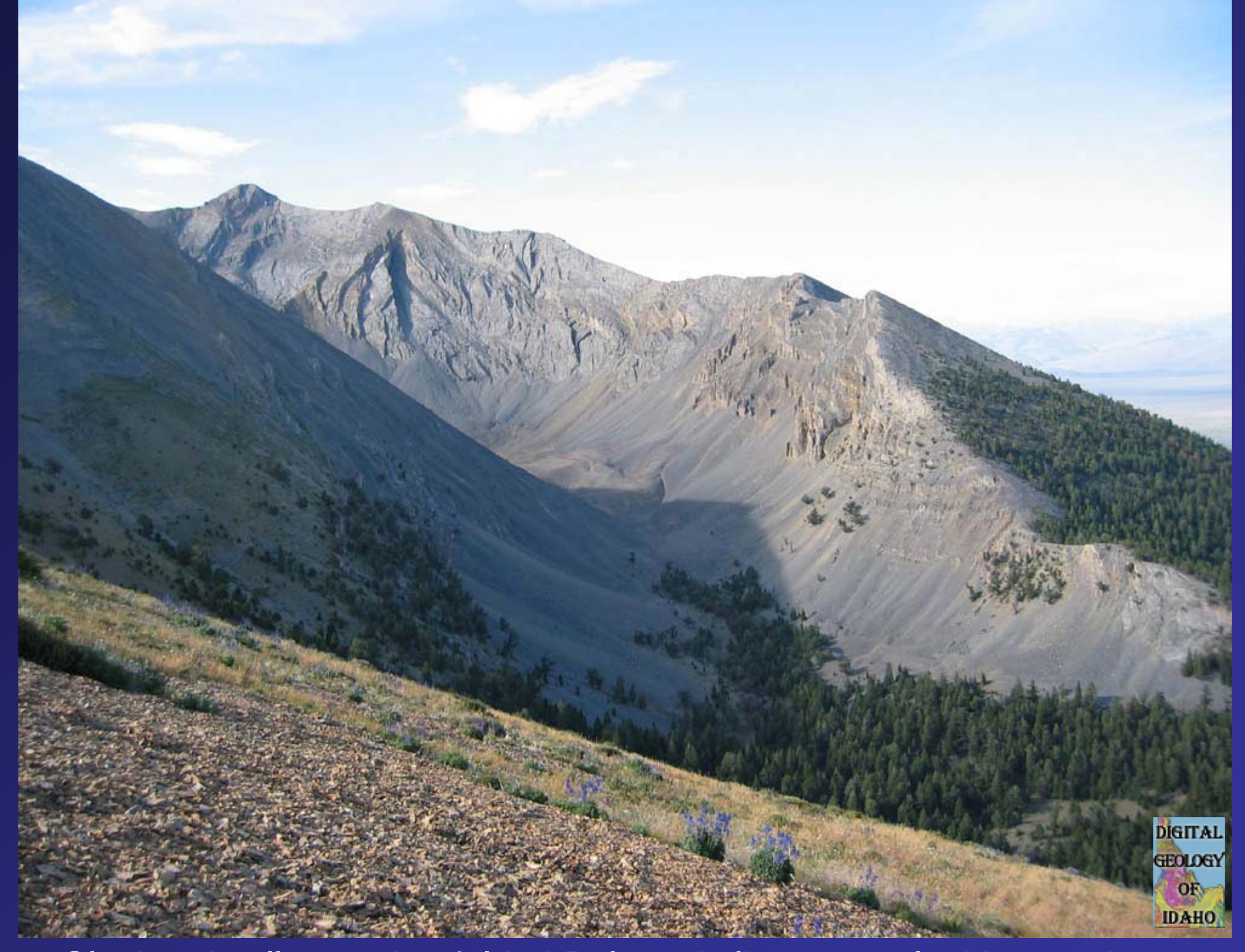
Glaciated valley cutting folded Paleozoic limestone, looking north near Doublesprings Pass, Lost River Range, Custer County