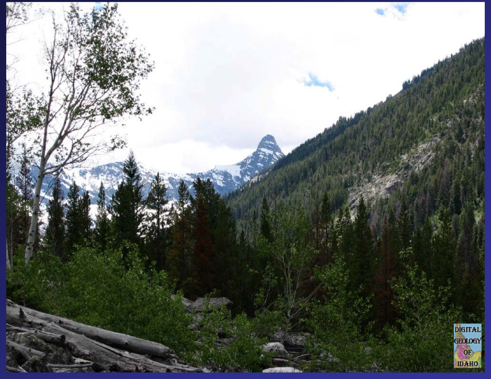
Old Hyndman Peak-glacial horn-head of Wildhorse Creek, Pioneer Mountains