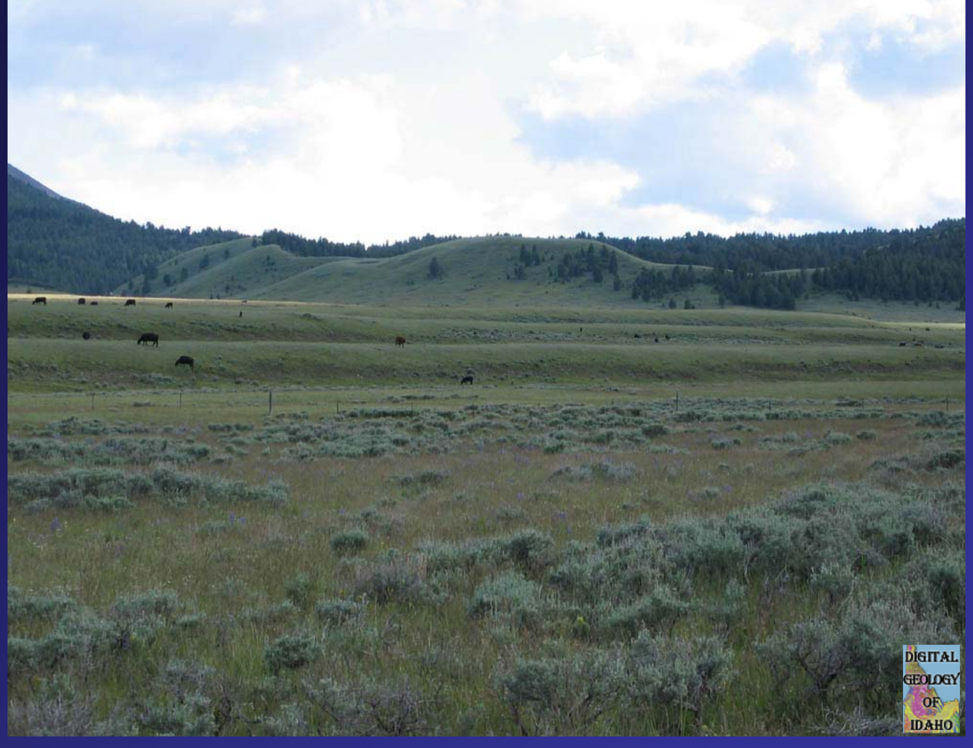
Terraced outwash with terminal moraine from Double Springs Pass in background-looking southwest on east side of Pass, Lost River Range