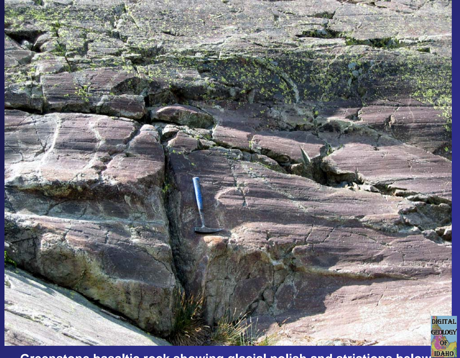
Greenstone basaltic rock showing glacial polish and striations below Sheep Lake, Seven Devils Mountains, Idaho County.