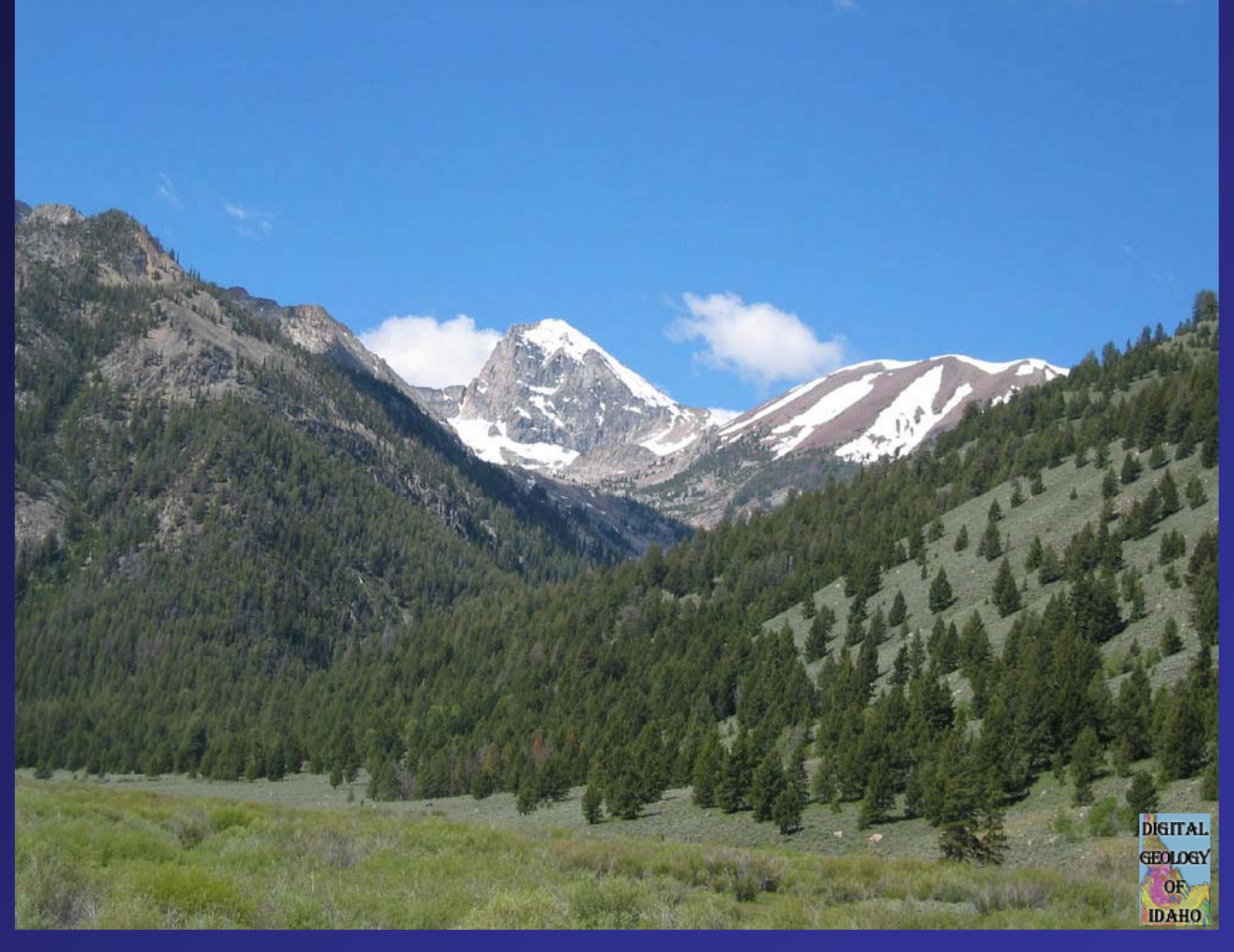
Glacial valley of Boulder Creek. Devils Bedstead in center of view. Photo Taken from near Wildhorse Creek campground, Pioneer Mountains