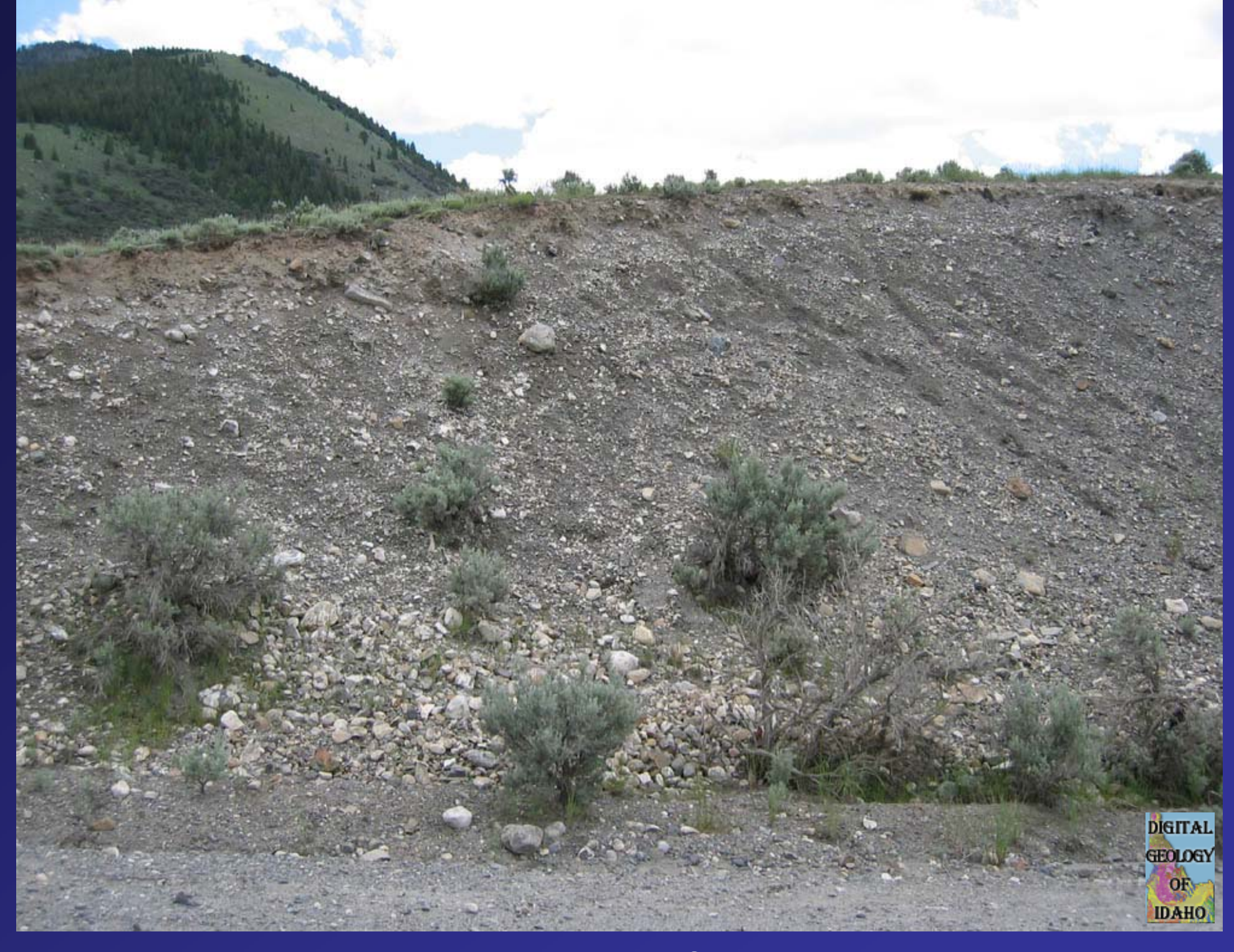
Lateral moraine along Wildhorse Creek, Pioneer Mountains