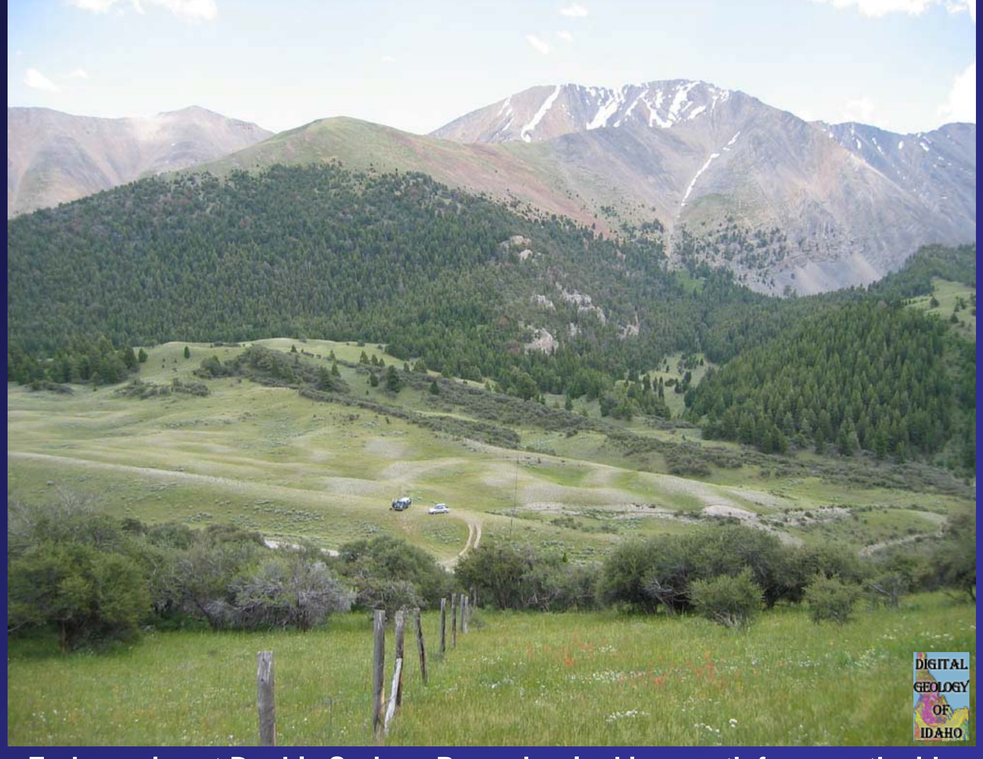
End moraine at Double Springs Pass-view looking south from north side of pass, toward Lost River Range